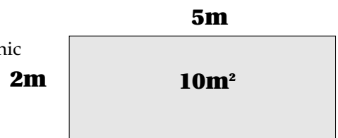
1m³ of soil will cover this area to a depth of 4" of 10cm

... Area in m² divided by 10 = volume of soil required in m³